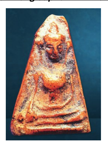
Phra Phong Suphan Pim Na Klang